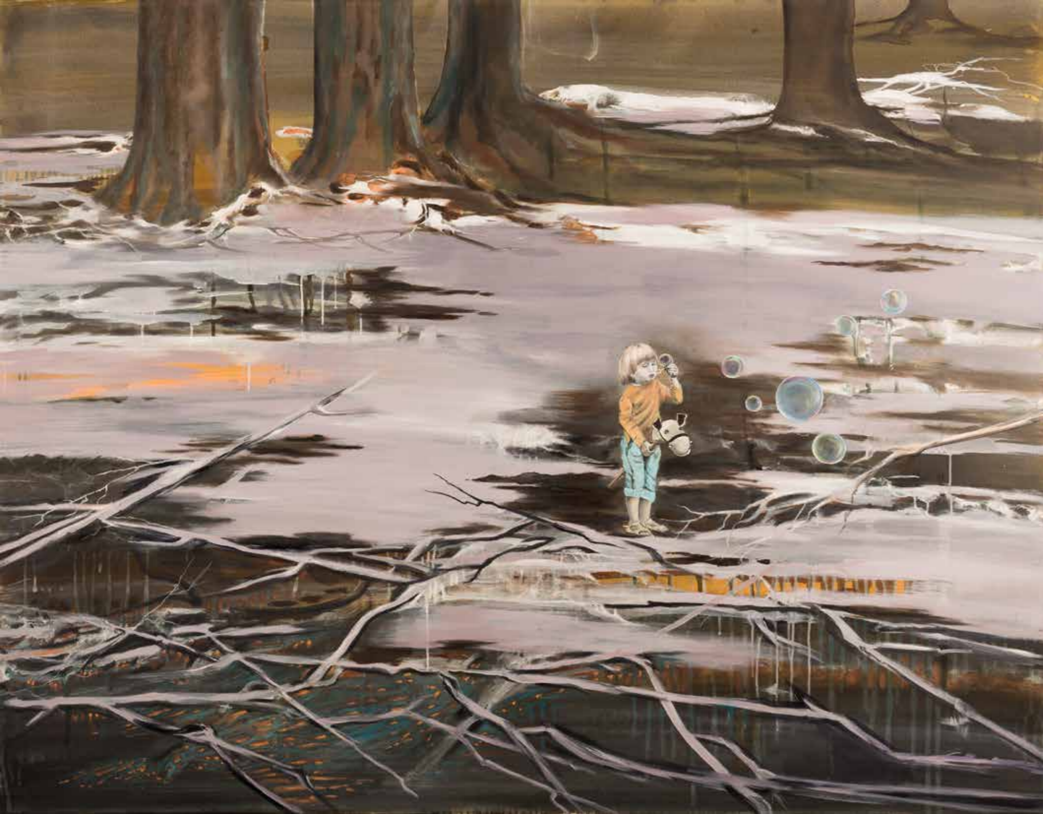
In the undergrowth - 2016 H 140x180cm Ink and oil on canvas