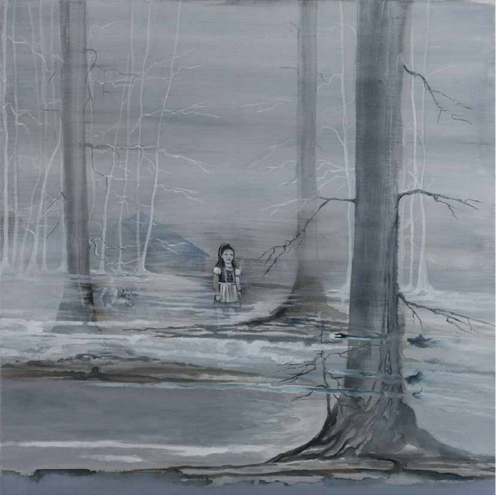
In the forest, there- 2015 H 90 x 90 cm Ink and oil on canvas