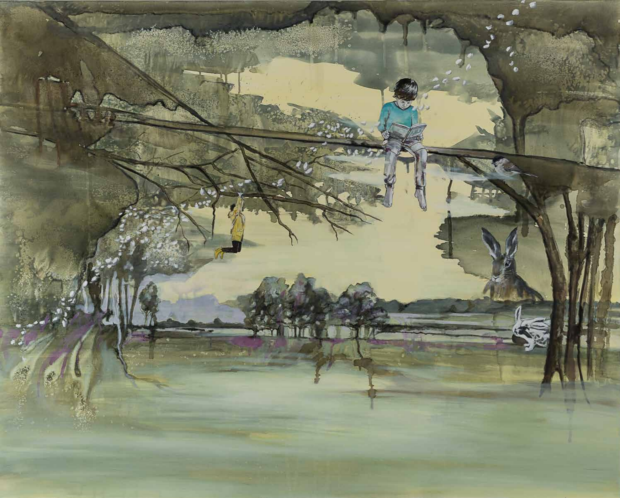
Where is the time- 2019 H 160 x 200cm Ink and oil on canvas