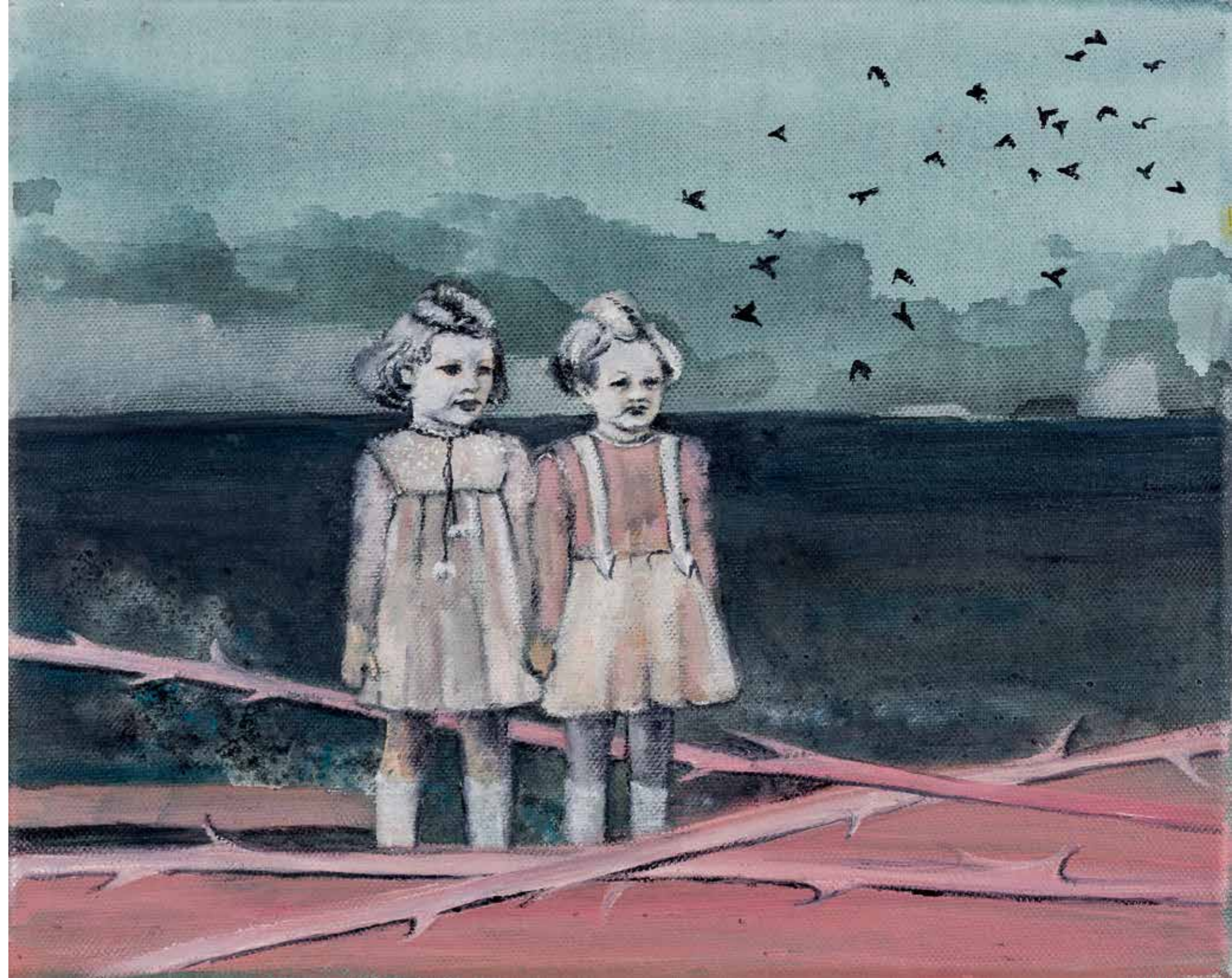
Not playing on railways - 2018 H 30 x 24 cm Ink and oil on canvas