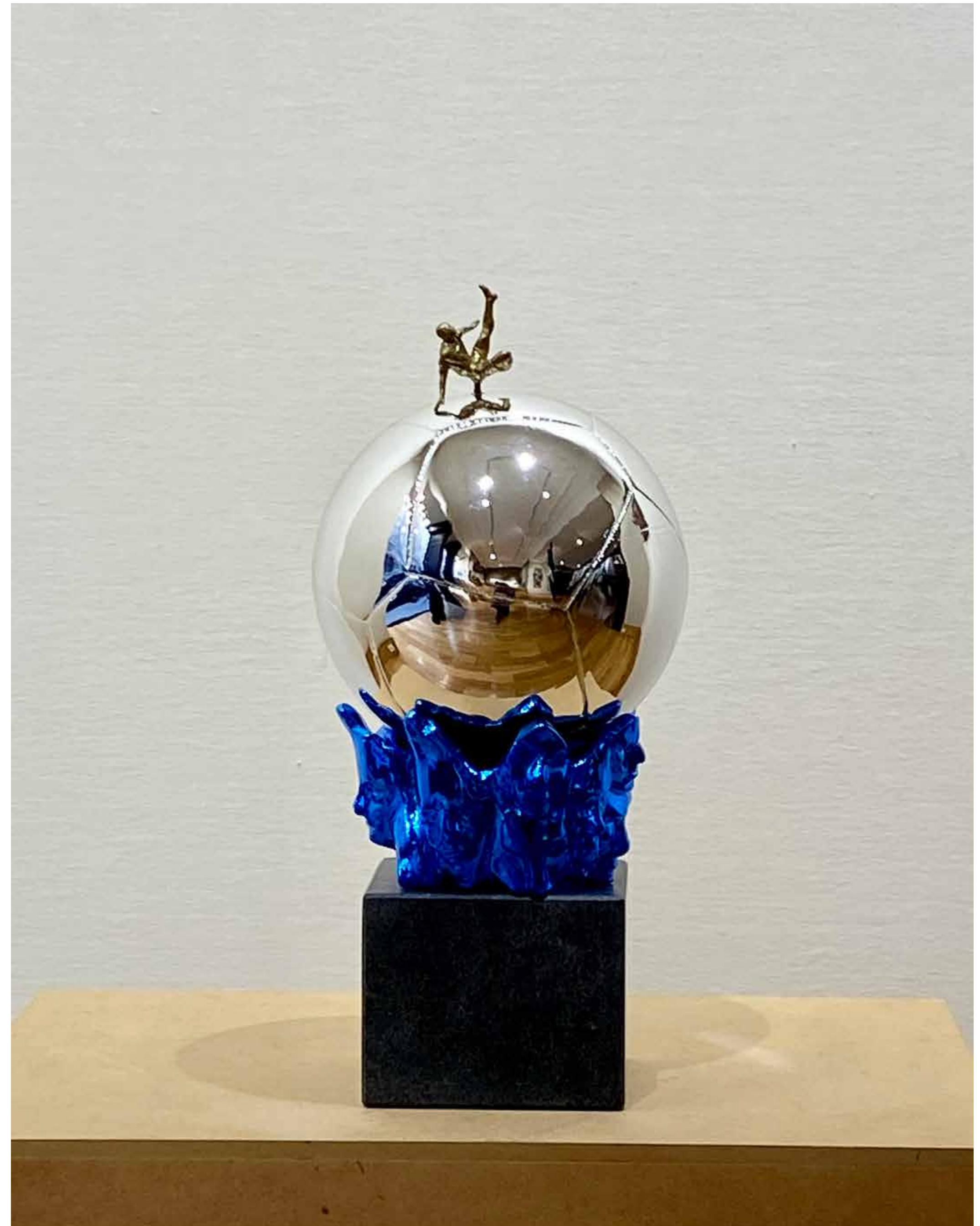
The blue crown and the migrant workers, (2022) Unique H 47x20x20cm Glass fiber, FRP, chrome plating, stainless steel, sea black stone