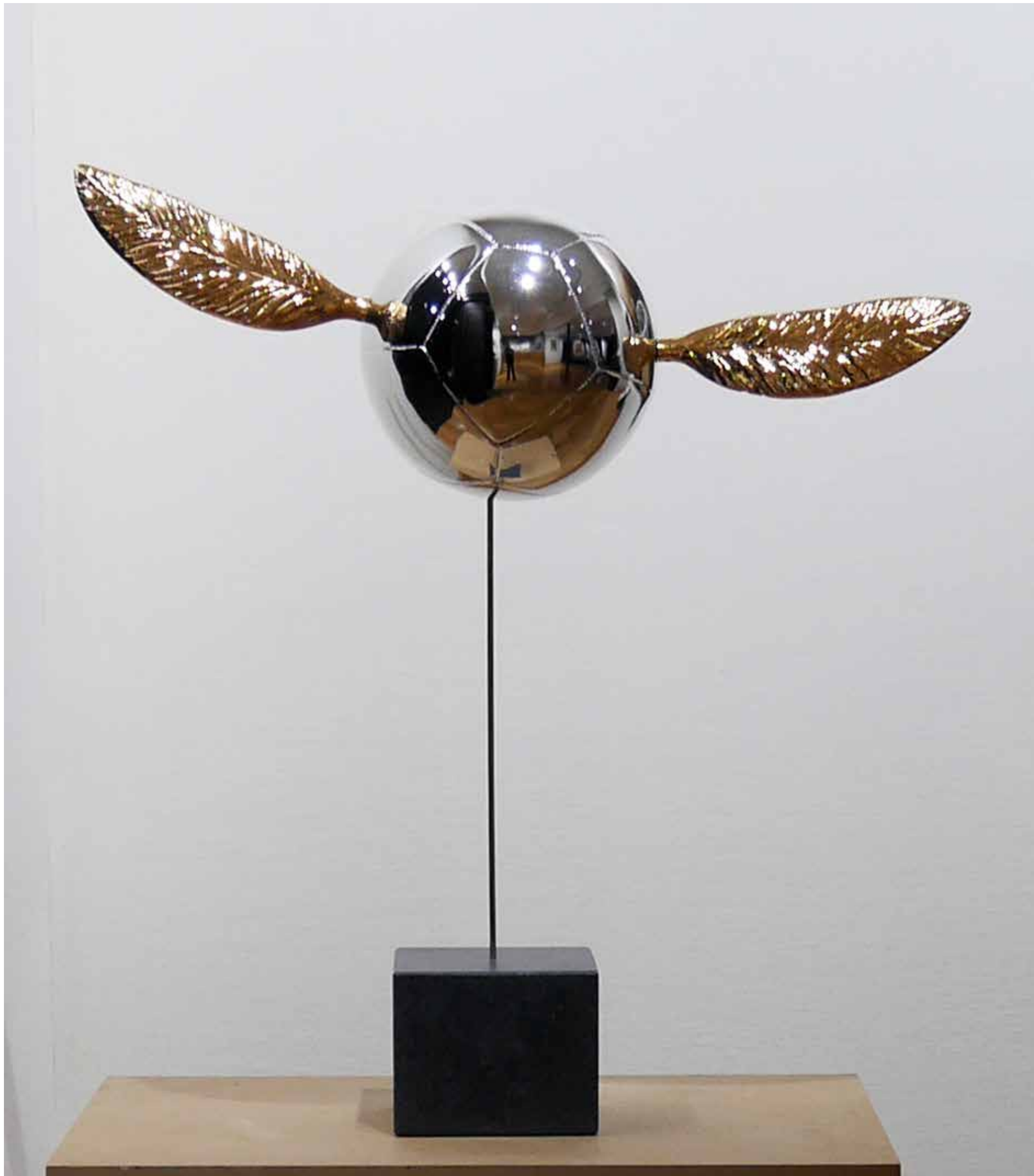
Fly to the Moon, (2022)