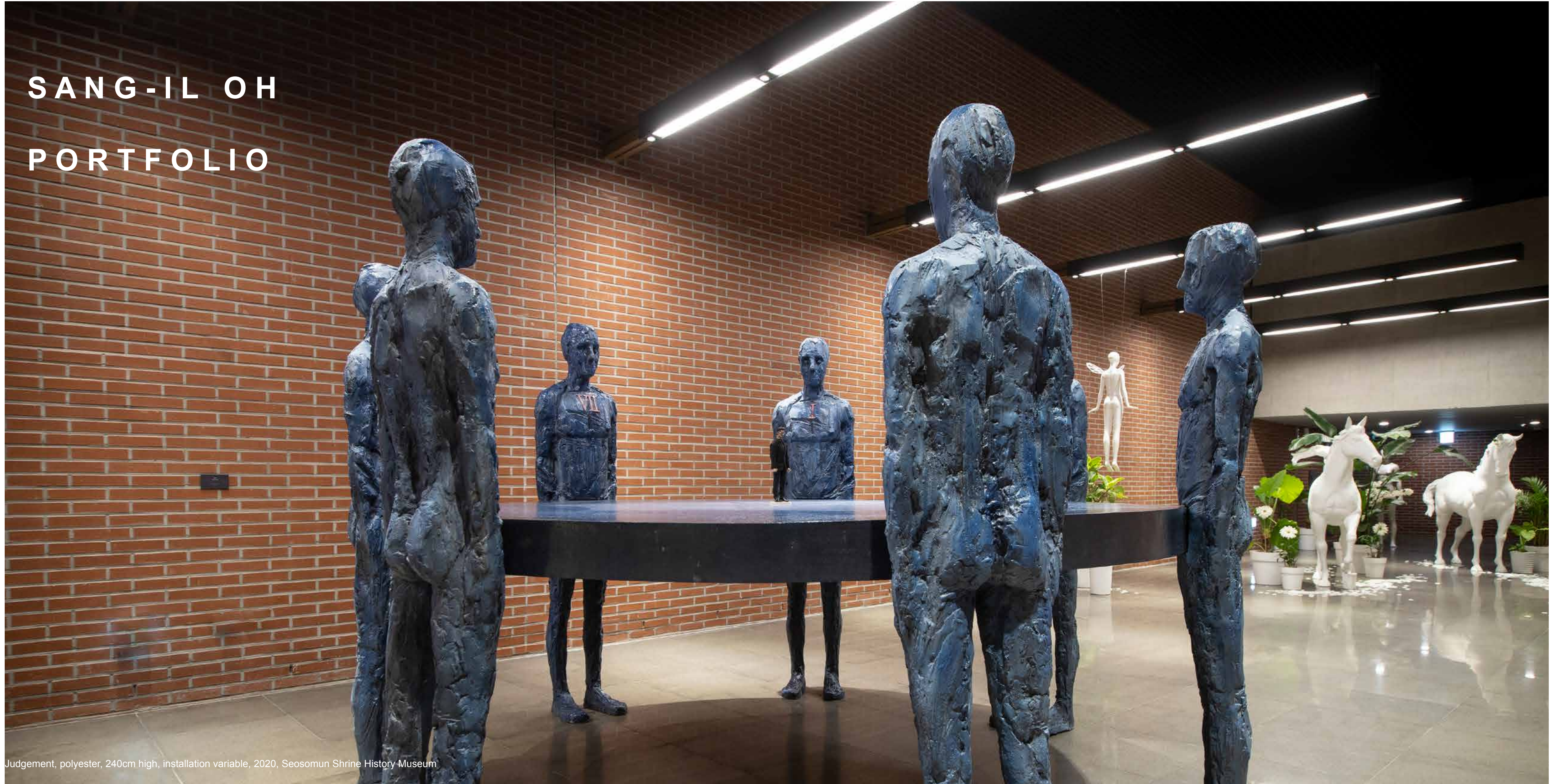
Judgement, polyester, 240cm high, installation variable, 2020, Seosomun Shrine History Museum