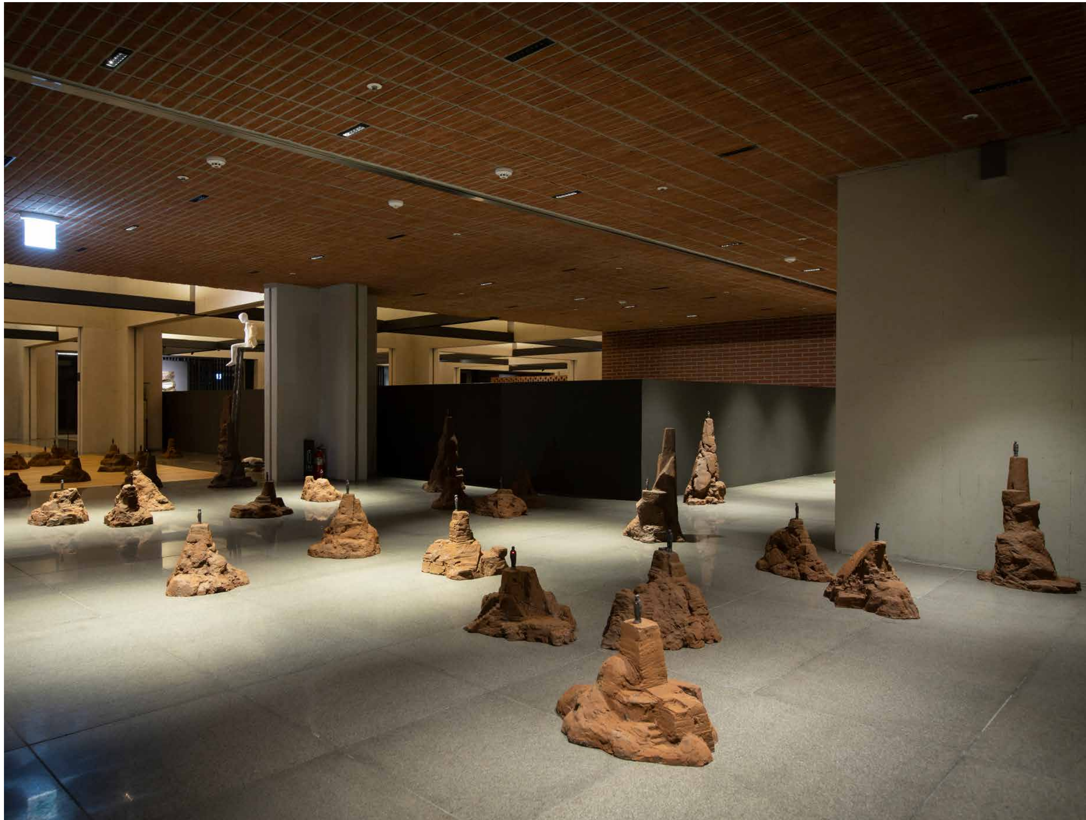
Islands, (together with an angel on the stool, overlooking the people of the islands), polyester, flickering LED, 25~90cm height, installation variable, 2020, Seosomun Shrine History Museum

As an artist and educator, he has been committed to figurative sculpture and installation about the human body. His earlier work is in academic boundary based on faithful depict of real figures, which was flown to the subject matter of human hardship, anguish, isolation, greed, death, irony, and absurdity in the middle stage. Through massive and melting down human figure, we can peep into his deep concern about human existence. By different media of video and installation expanded from sculpture, he challenges a new aesthetic experiment.