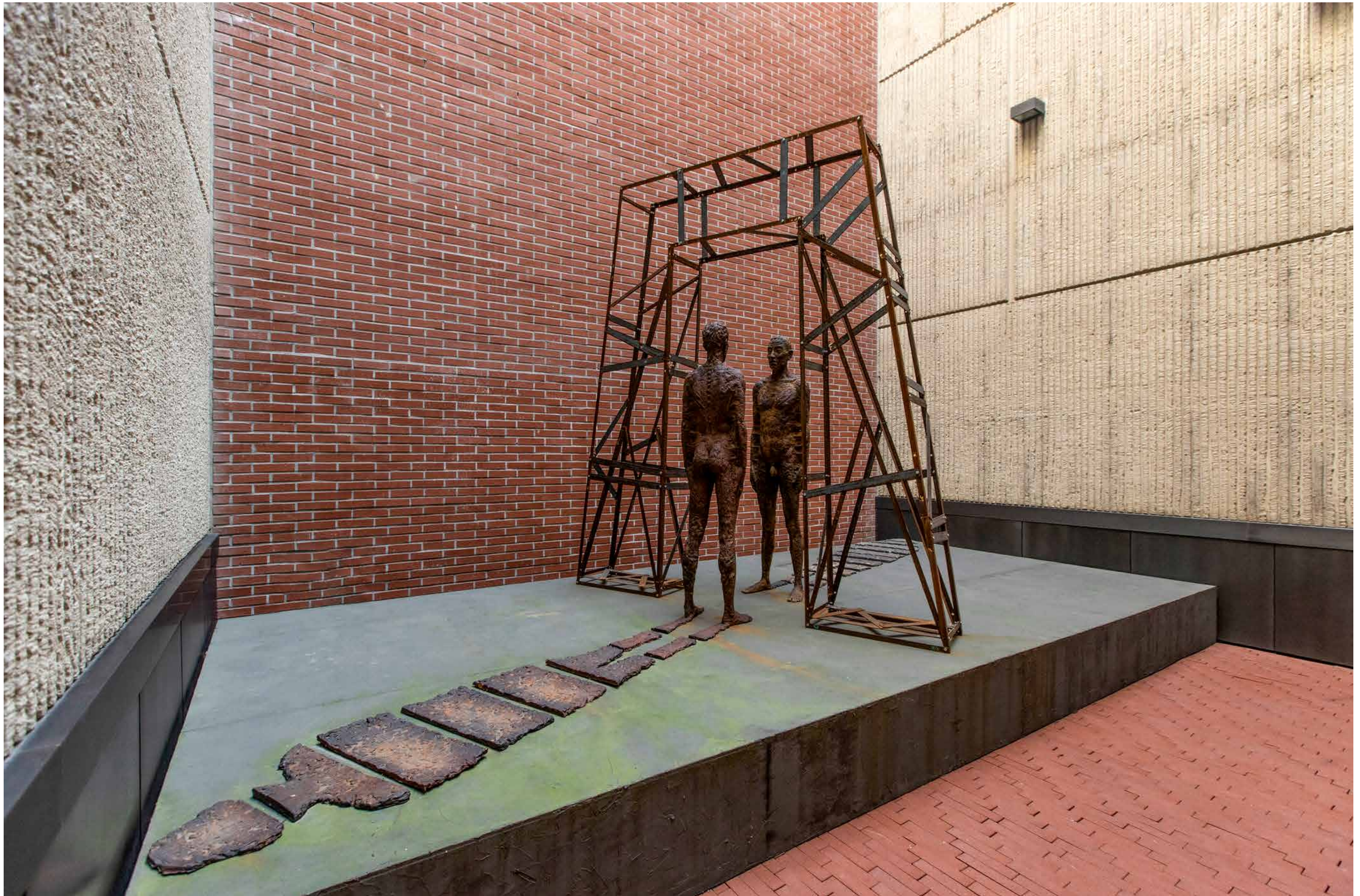
And They Never Gave a Hug, bronze, iron beam, 750*280*350cm(h), 2020, Seosomun Shrine History Museum