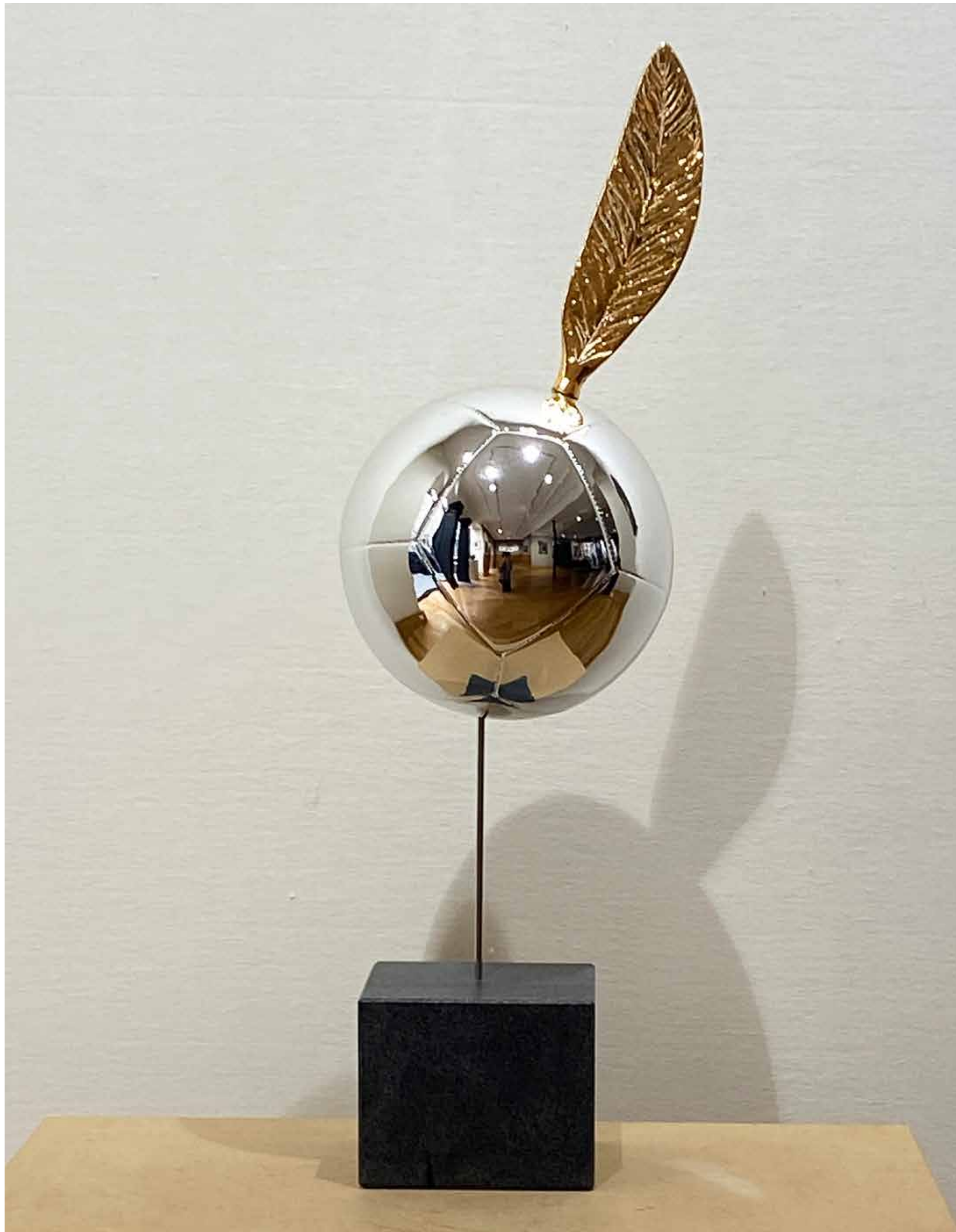
Soccer for the Cherokee, (2022) Unique