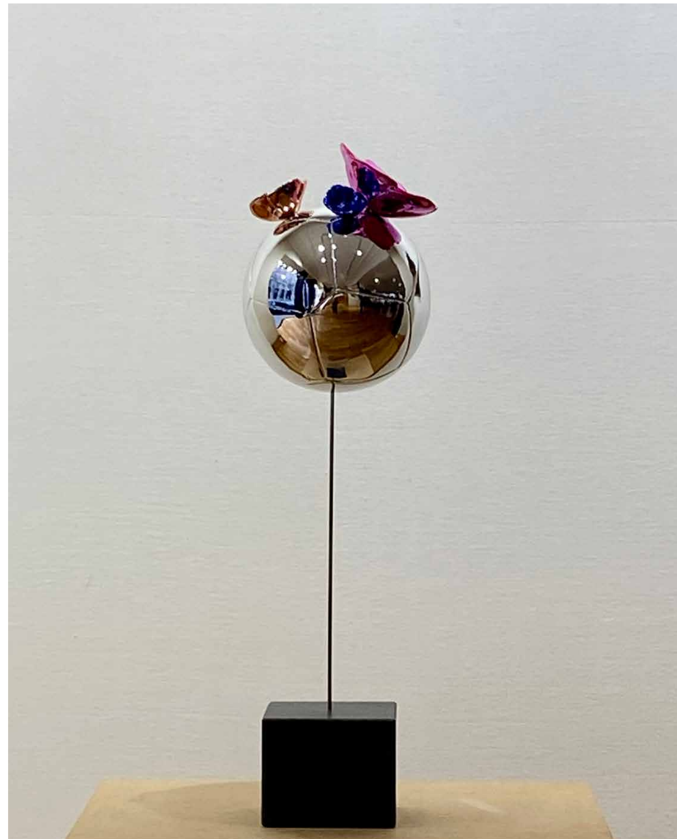
Poppy is also a flower, (2022) Unique H 62x20x20cm Glass fiber, FRP, chrome plating, stainless steel, sea black stone